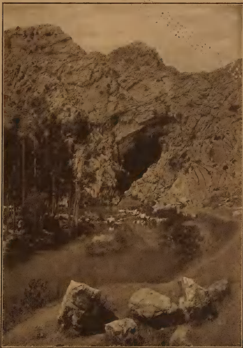
A MOUNTAIN GROTTTO